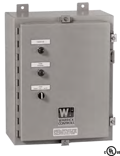
Single-function standard panel