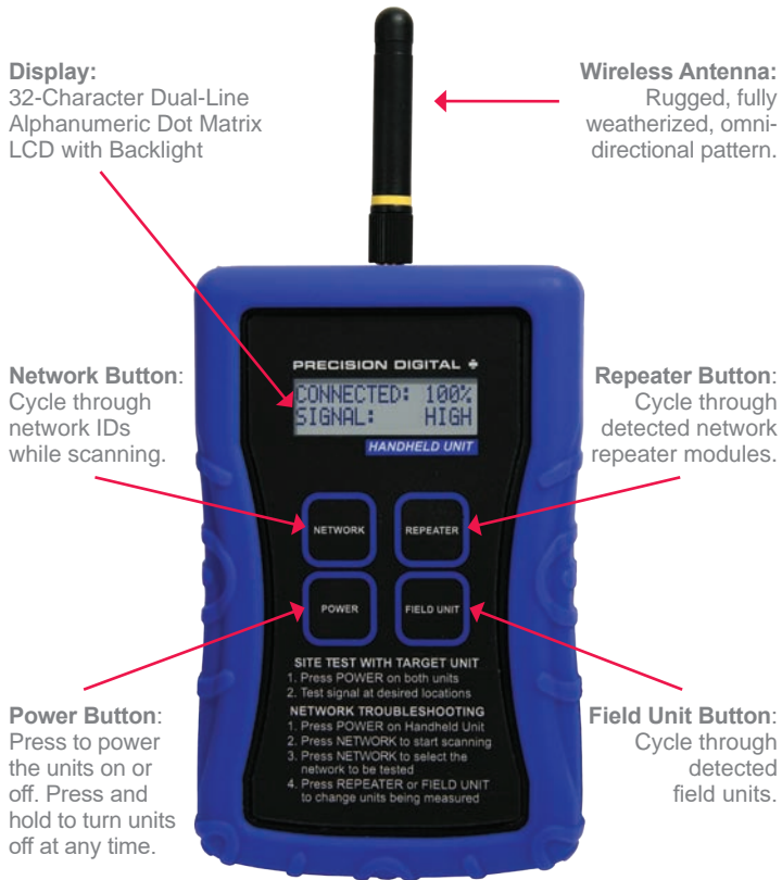
▲ PDA10 Handheld Unit Shown

The four buttons on the face of the handheld unit make it simple to power on the unit and start testing your devices for wireless signals. Cycle through any of your network to test field units and repeaters for strong wireless signals.