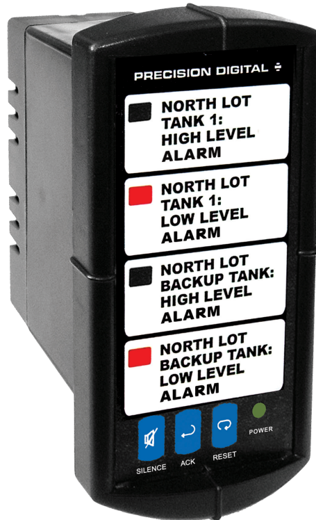
Model PD154 / 4-Point