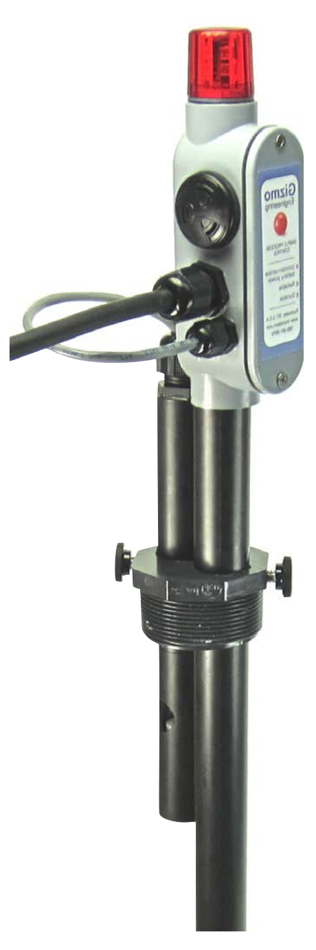
Easy installation: simply adjust the pipe depths with thumbscrews, and plug in the piggyback power cord. No tools needed. No hard wiring.

The LC-2 Level Controller will control a pump or solenoid valve to automatically regulate the level in a tank. A third float provides a built-in emergency alarm for over filling.