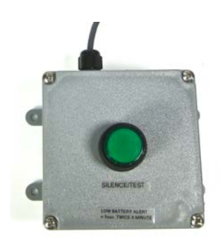
REMOTE SHUTOFF OPTION