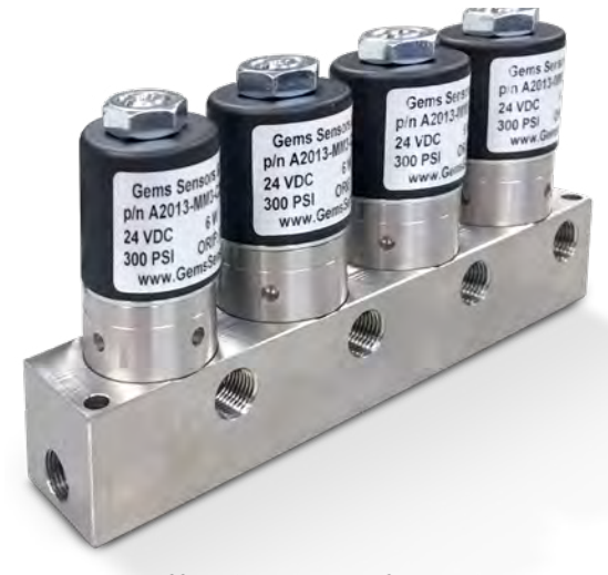
4-Port Return 303 SS manifold. Pictured with Gems manifold mount solenoid valves—sold separately. Select from Gems A Series or B Series for use with these manifolds.