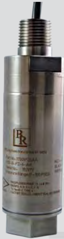
Models 111X/P, 211X/P, 311X/P & 311N/AN/GN Explosion Proof & Zone 2/Div 2 Pressure Transmitter