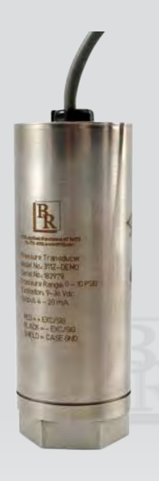
Model 311 Z, I, GI, AI Intrinsically Safe Pressure Transducer