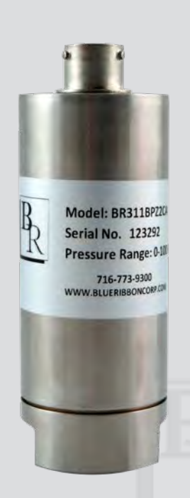
Model BR111 / BR211 / BR311 Industrial Grade Pressure Transducer