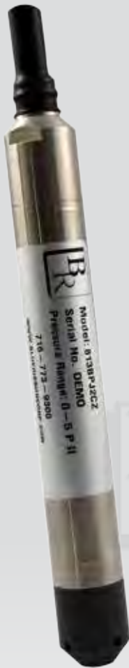
Model BR913 Serial/Digital Interface Submersible Level Transmitter