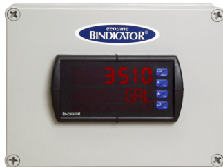
PRD1000 in NEMA 4X Enclosure

MSZ EN 60079-0:2013 MSZ EN 60079-0:2013/A11:2014 MSZ EN 60079-11:2012